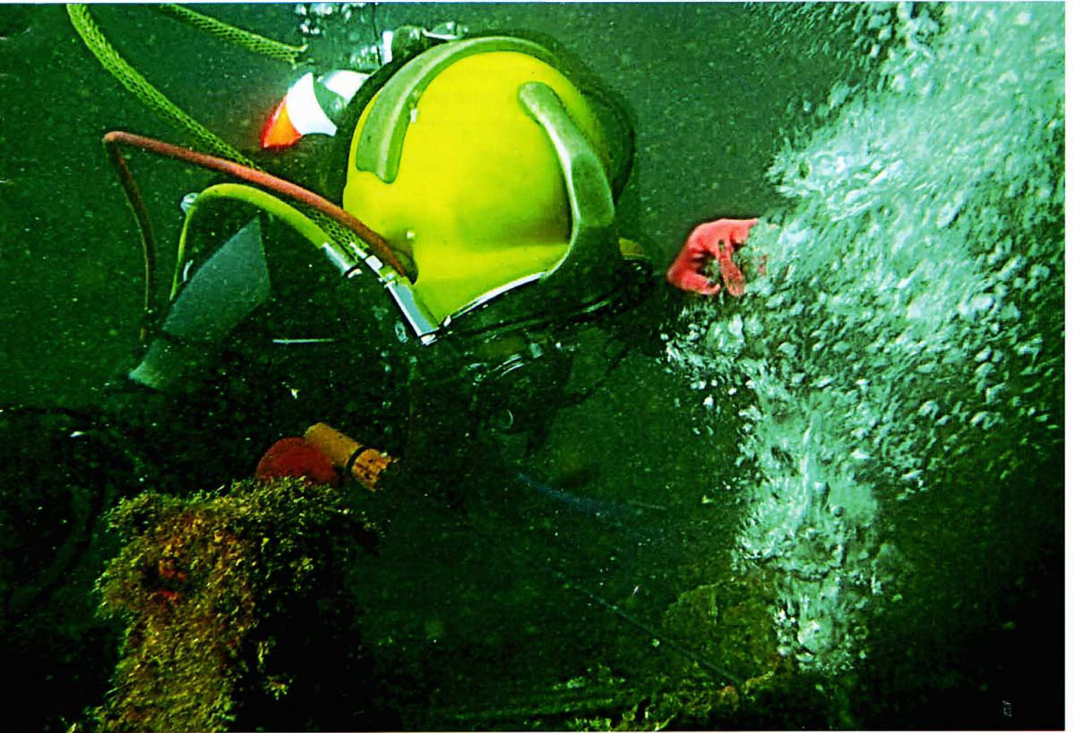
A student during training.